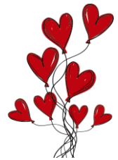
The Valentine's Party with a cupcake decorating station was a hit.