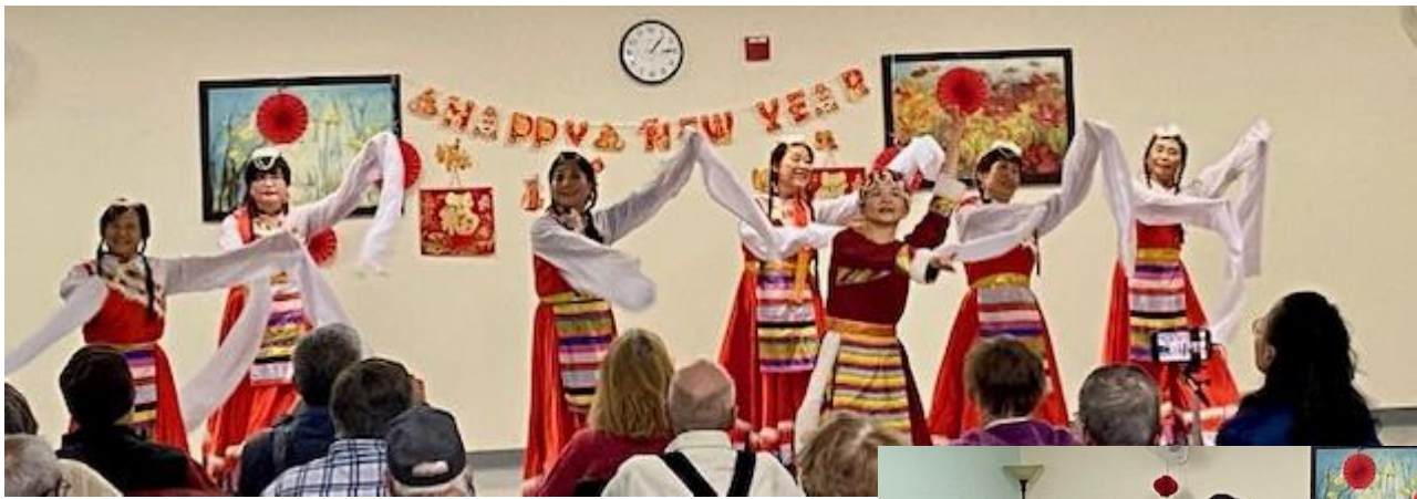
Celebrating Lunar New Year